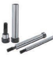
Stripper Bolts 等高螺柱