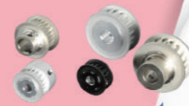
TIMING PULLEY 皮帶輪