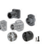
Holders for Shaft 導桿架