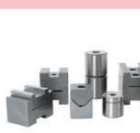
Locating Block Sets 定位塊