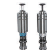
Guide Post Set for Mold 模架用大導柱組件