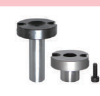
Sprue Bushings 灌嘴