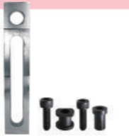
Tension Link 張力環