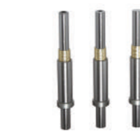
Miniature Ball Bearing Guide Sets 微型組件