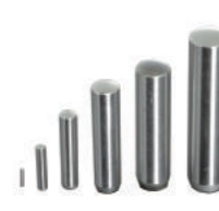
Dowel Pin 定位銷