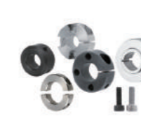
Set Collars with Setscrew 固定環