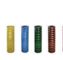
Coil Springs 扁線彈簧