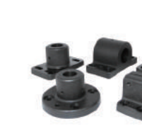
Stands for Device 支撐座