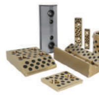
Oil Free Series 無給油系列