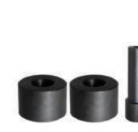
Support Pillars 支撐柱