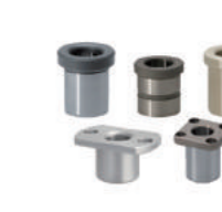
Bushings for Locating Pin 定位銷用襯套