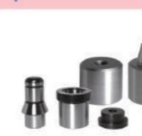
Tapered Pin Sets 錐度精定位銷組件