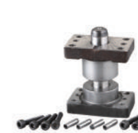
Plain Guide Post Sets 獨立導柱組