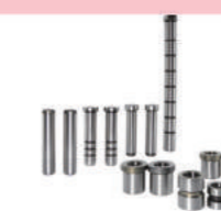
Precision Leader Pins 塑模用精密定位導銷