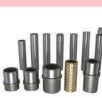
Precision Ejector Leader Pins and Bushings 精密頂出導柱套