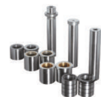
Guide Pin and Guide Bushing 卸料板導柱套