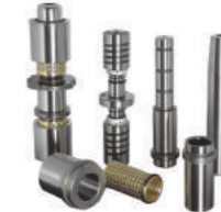
European/American Standard 歐美規格