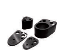
End Retainer Sets 固定座組